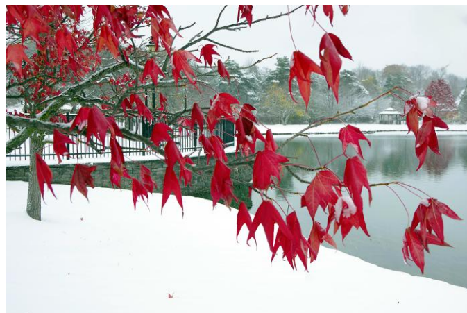
“First Snow Fall of the Season”

This presentation explores one of the most exciting Presidents in American history. Born into wealth, Theodore Roosevelt used his resources to help the American people with what he called, "the Square Deal." Great information about his childhood, his cowboy years and his family will certainly be entertaining for all.