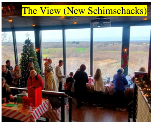
The View (New Schimschacks)