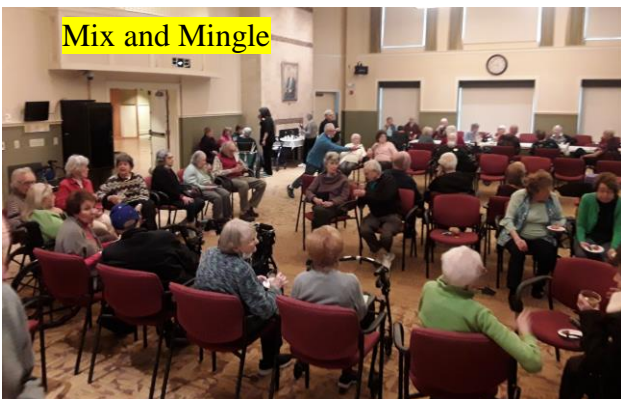
Mix and Mingle