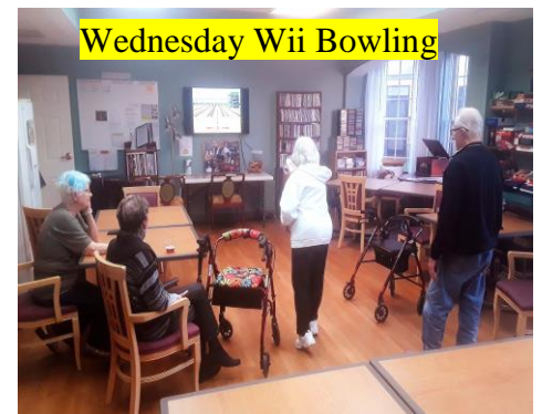
Wednesday Wii Bowling