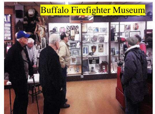
Buffalo Firefighter Museum