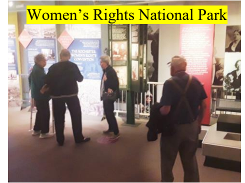
Women's Rights National Park