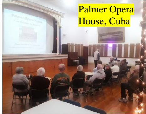
Palmer Opera House, Cuba