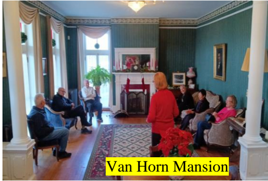
Van Horn Mansion