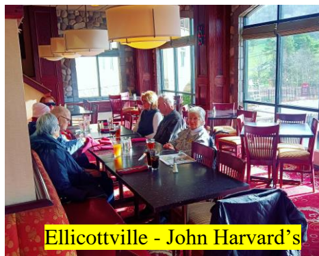
Ellicottville - John Harvard's