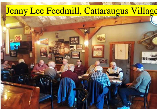
Jenny Lee Feedmill, Cattaraugus Village