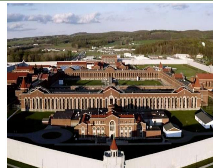
Buffalo Bison's game & ariel view of Attica Correctional Facility.